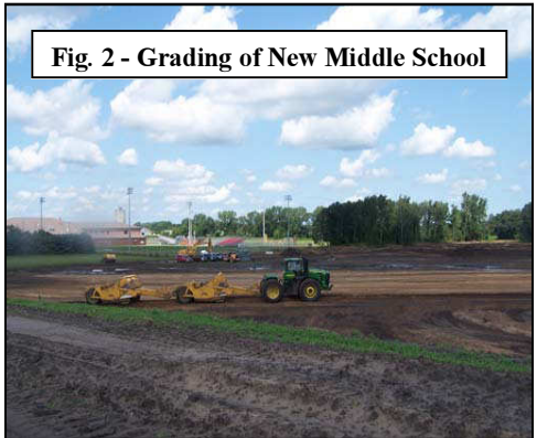
Fig. 2 - Grading of New Middle School

In January of 2009 the Kankakee Valley Community voted in a referendum to approve a $60 million dollar bond issue to construct a New Middle School Facility. The referendum passed and ground breaking began in June of 2009. The site has been rough graded; State Highway 10 has been widened and turn lanes have been installed. The Project is being phased to allow a more competitive bidding process and have local contractors involved. Bids were received well under the estimates. The building construction started in October of 2009 with final occupancy in August of 2011.