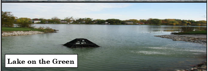
Lake on the Green