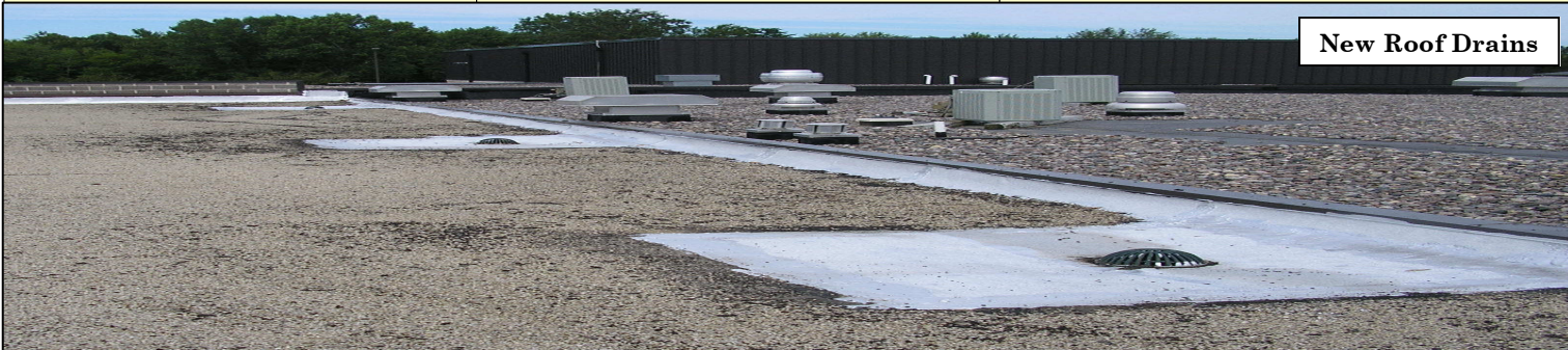
New Roof Drains

The evaluation indicated that the existing roof was in good condition and that with some minor repairs it could last 5-10 more years. The thermal imaging showed moisture present around the roof drains and along some flashing. This ultimately saved the district thousands of dollars in their maintenance budget by not having to replace the entire roof.