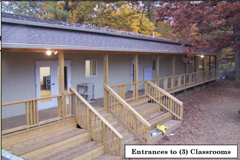
Entrances to (3) Classrooms

These engineering accomplishments will allow the Renaissance Academy to grow and serve more children with an excellent education.