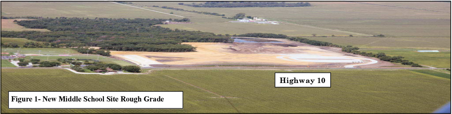
Figure 1- New Middle School Site Rough Grade