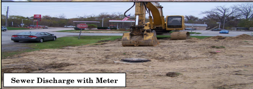
Sewer Discharge with Meter

DID YOU KNOW? Once Thanksgiving dinner is done and you're storing the leftovers, the USDA recommends you keep cooked turkey meat no longer than four days and gravy only one to two days. If you're freezing leftovers, use them within six months for best quality.